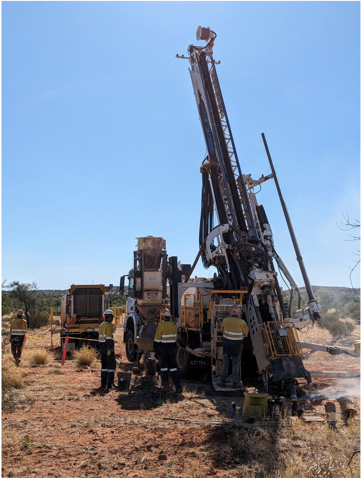
Figure 1: Maiden RC drill rig underway at the Bruce REE Prospect.