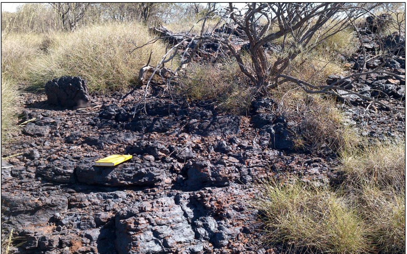
Figure 4. An example of the blocky manganese enriched shale mineralisation at KR 1 located within E46/1383.