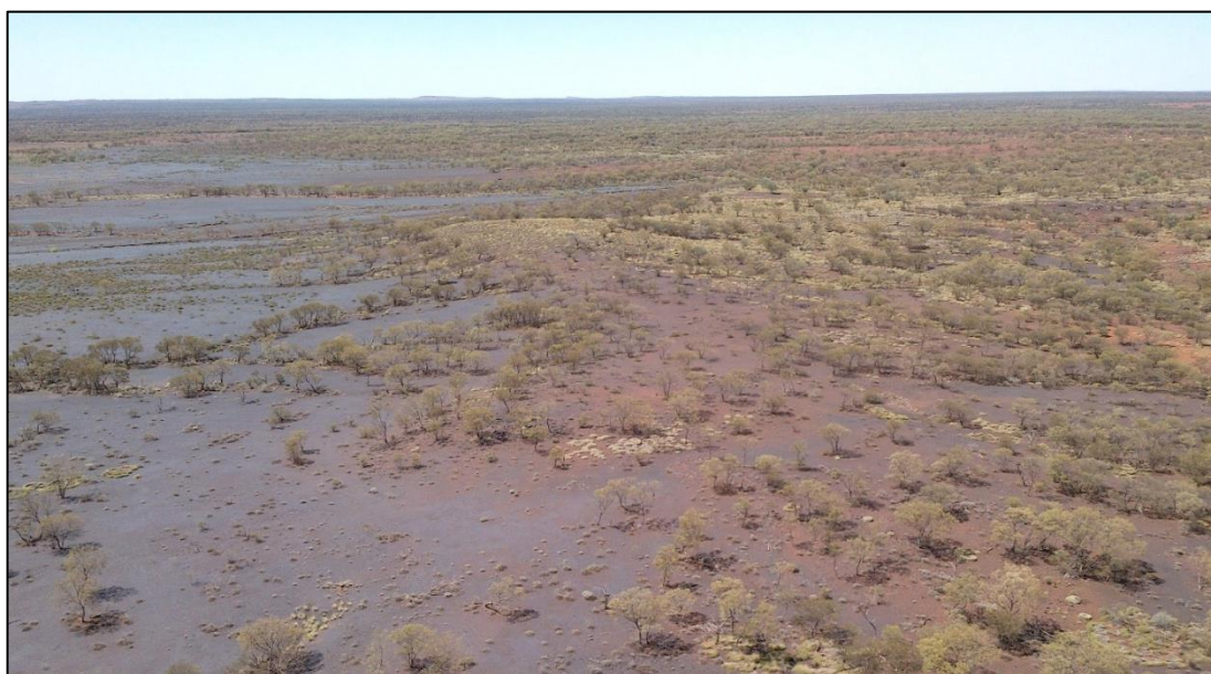
Figure 2. Part of the KR1 target comprising an elevated 500m long outcrop of manganese enriched shale within license E46/1383 (looking to the southeast).