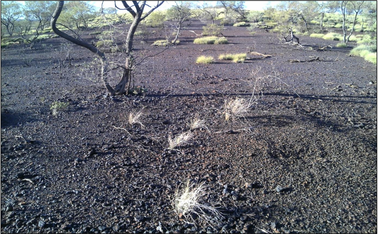
Figure 3. Widespread manganese enriched shale mineralisation at KR1 within E46/1383 (looking to the southeast).