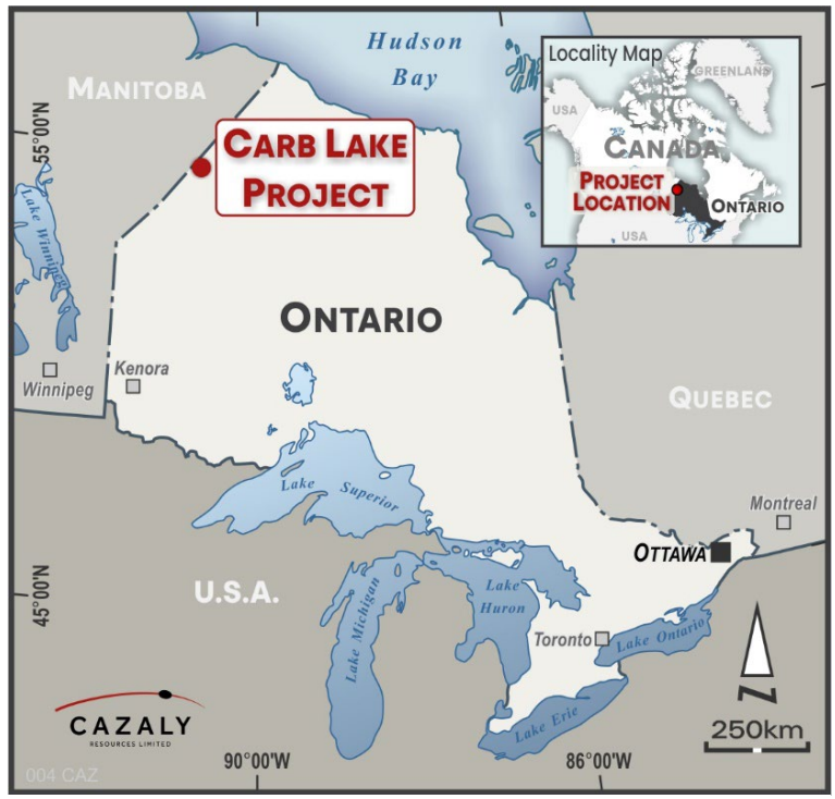
Figure 1. Location of Carb Lake Carbonatite Project in northwest Ontario

As part of the due diligence process Cazaly gained access to the diamond drill core, stored at the Ministry of Mines Geological Survey in Kenora.