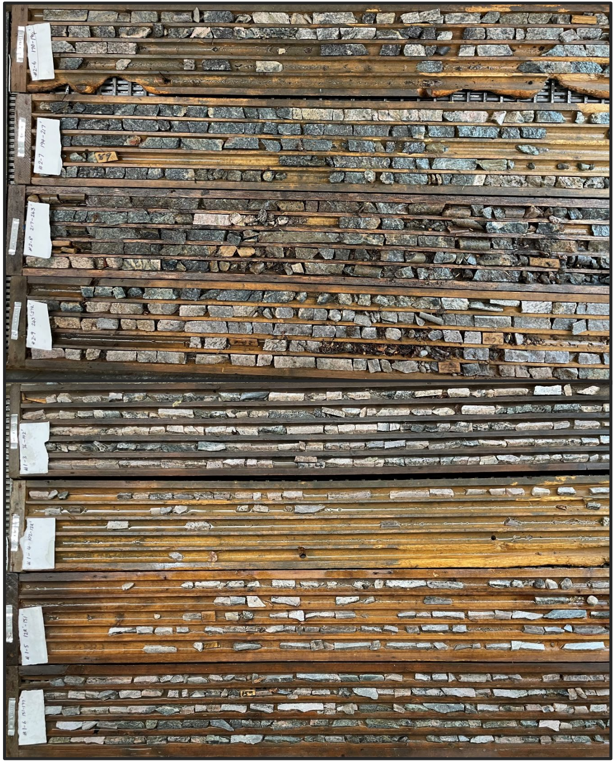
Figure 2. Example of diamond drill core condition from DD001 and DD002

*Geological observations are qualitative and only include dominant minerals of interest. Mineralogy has been identified by an experienced geologist however has not been confirmed through petrographic studies.