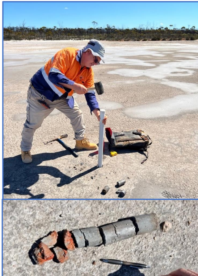
Figure 3. Lake Hope showing the push tube sampling method and an example of the lake clay from the push tube.

The resource was defined by 254 short, vertical drill holes (for 264.9 metres) drilled on a nominal 100 metre by 100 metre grid. Of these, 174 holes (for 215.67m) were drilled by a 70 mm screw hand auger and 80 holes were drilled using a 50 mm or 65 mm PVC push-tube hammered into the lake clays (Figure 3). Sample recovery was at least 95% and sample quality is considered good to excellent.