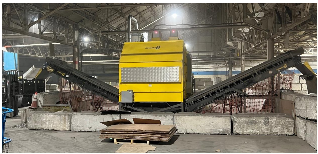
Ore sorting testwork underway in Kentucky, USA

Ore sorting using sensor technology has been successfully used at a commercial scale at many locations worldwide. Initial ore sorting testwork has been undertaken at a facility in Kentucky, USA with results pending.