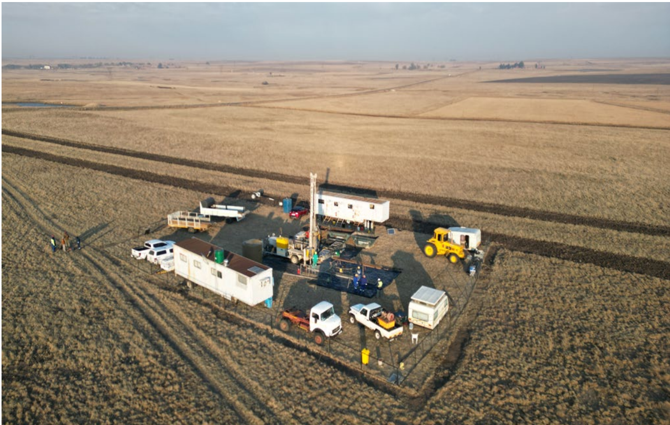
Figure 1: Drilling operations at core well ER272-06C

Core well 272-05C and 272-06C, have been spudded approximately 12kms from South Africa's largest synfuels refinery and 8km from substantial gas intervals discovered in completed core wells 272-01C and 272 02C. The continuation of exploration success will increase the potential that gas producing fields can be established in close proximity to the Secunda refinery operated by Sasol which could be a substantial off-taker of gas (Figure 1 and 2).