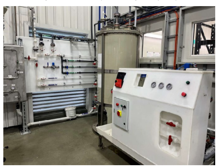
Figure: Crystallisation unit

QPM is also seeking to actively engage with potential HPA customers. It has recently appointed an in-house Technical Marketing Manager who will drive these efforts in cnjnn with external HPA marketing experts. The samples from the Demonstration Plant will be critical to customer engagement.