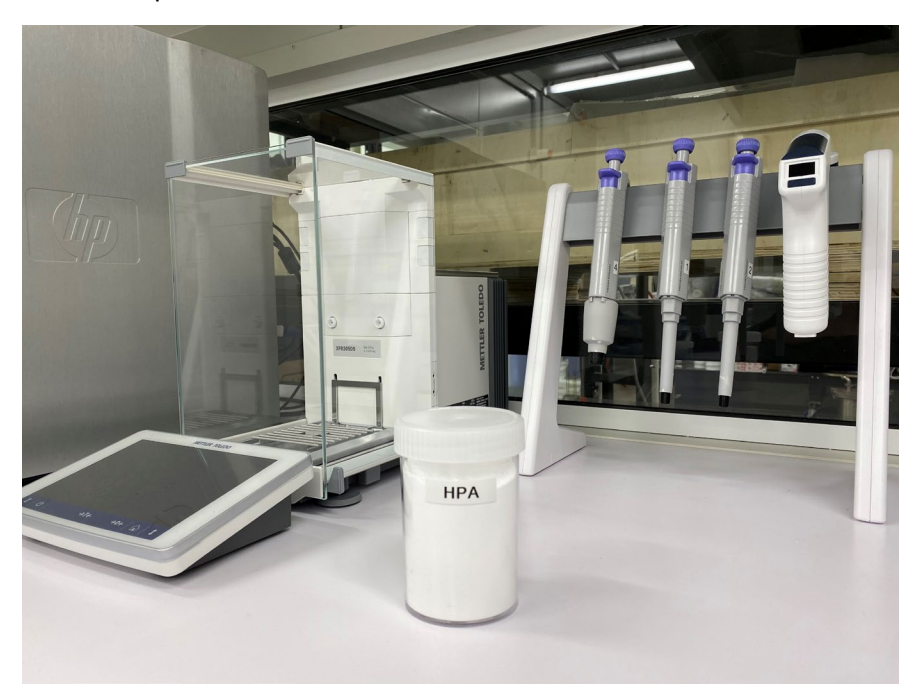
Figure: Sample from which material from analysis tabulated above was drawn in the QUT laboratory.

Both QPM and Lava Blue are excited to have achieved 4N HPA during the commissioning phase of this project. Lava Blue will continue to operate the Demonstration Plant with a target of producing 60 kg of 4N HPA. The operation of the Demonstration Plant is also providing valuable technical information for the design of commercial scale plant.