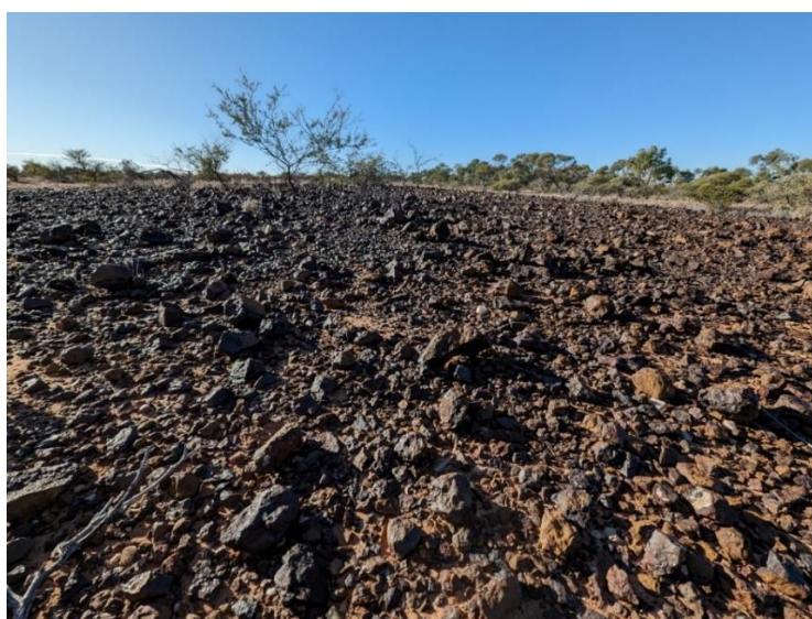
Figure 1. Outcropping ironstone at Bentley. MGA94 (395186E, 7333447N)

At the Bentley prospect, ironstones have been discovered and mapped over a zone of approximately 400m. At Mac’s Well ironstone has been confirmed inside a large radiometric anomaly 1 . Results from rock chip samples are expected over the next few weeks, although physically the rocks look similar to other known ironstones in the region which host rare earths deposits.