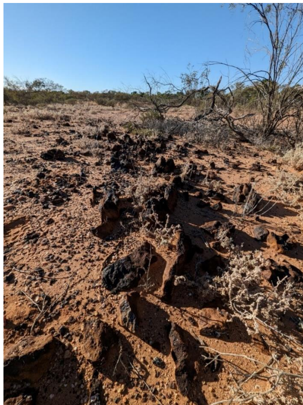
Figure 2. Bentley ironstone outcrop, approximately 200m east from figure 1 above. MGA94 (395398E, 7333418N)

The company remains optimistic about the potential to discover more ironstones with exploration ground assessment activities having only just commenced.