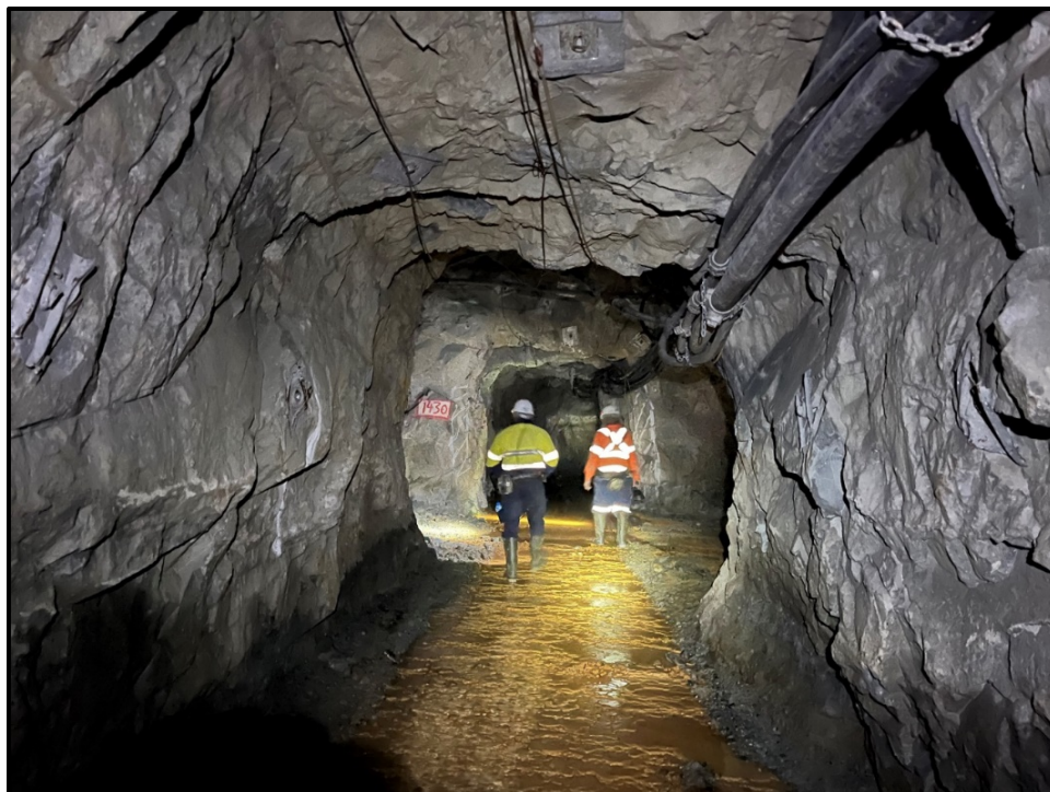
Image 1: On-site workers in Amalgamated Adit/640L mine access point for the Reward gold mine with clean floors, good quality ground works and service pipes, all in very good condition