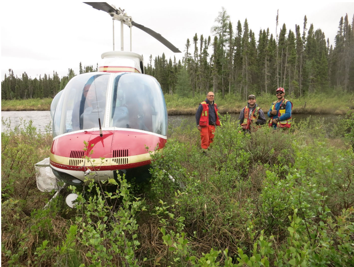
Figure 1: Attwood Lake Phase 1 Exploration and APEX Geoscience Crew.

The Phase 1 Program consisted of a team of four geologists who undertook mapping and sampling at Attwood Lake ( Figure 1 ). Numerous pegmatite showings were discovered on the Project with a total of 209 rock grab samples collected from various pegmatitic bodies.