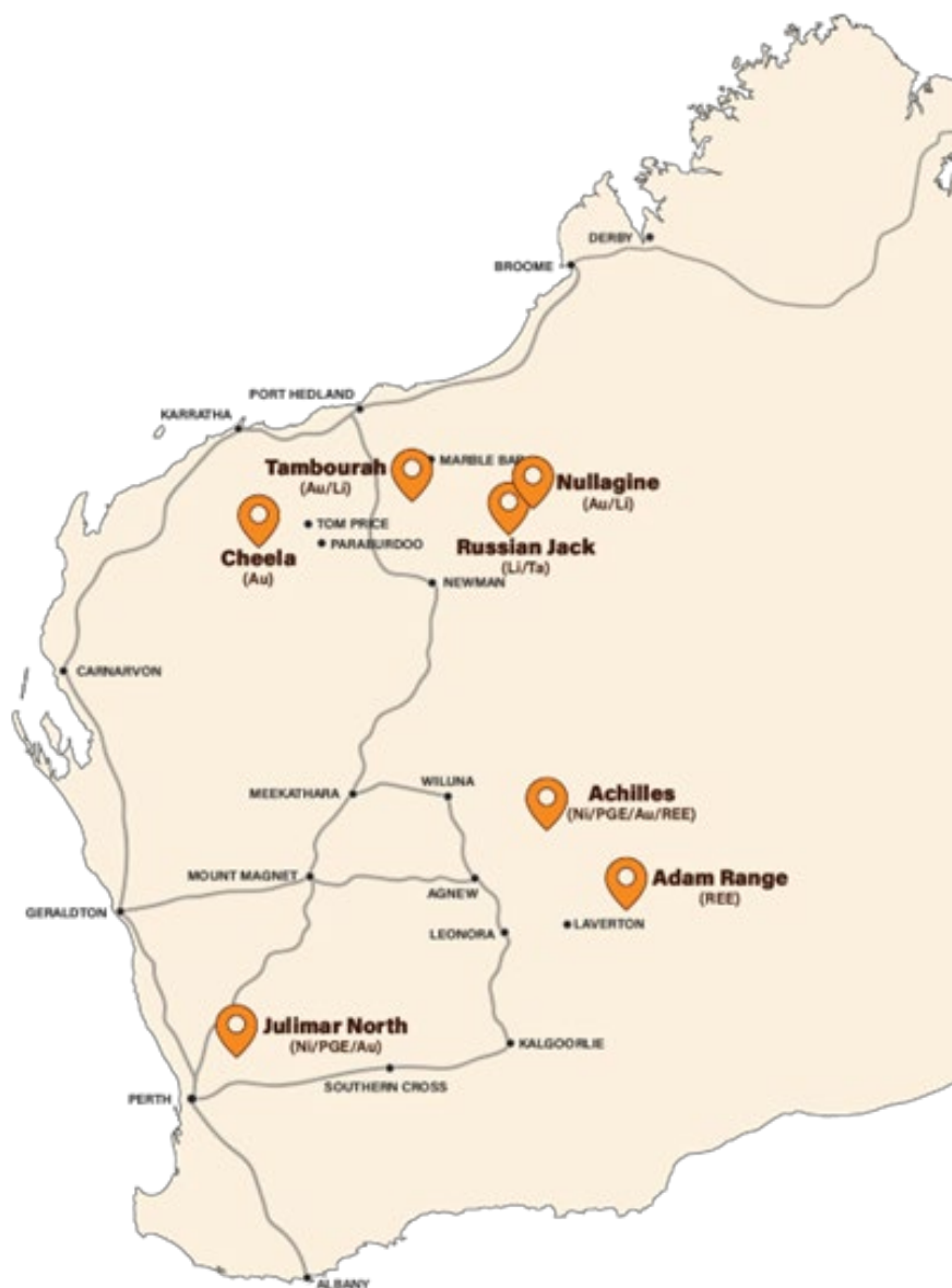
Figure 1: Tambourah Pilbara Projects - Location Map

Tambourah Metals Ltd (ASX: TMB) is a Western Australian focused exploration company, with the primary objective of the rapid exploration and development of critical minerals and gold projects. TMB has three Lithium Projects in the Pilbara Region – Russian Jack, Tambourah Lithium and Nullagine Lithium; three gold projects in the Pilbara Region – Tambourah, Cheela and Nullagine; Ni-PGE-Cu-Au projects at Julimar North. In the NE Goldfields exploration for Ni-PGE-Cu and REE at Achilles Project including REE at Adam Range.