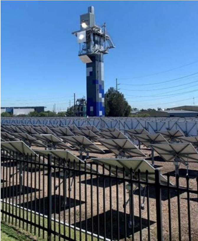
Figure 1: CSIRO Energy Centre solar concentrator facility