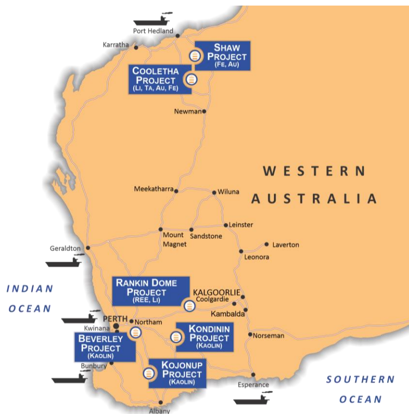
Figure 1. ACM Portfolio of Western Australian projects