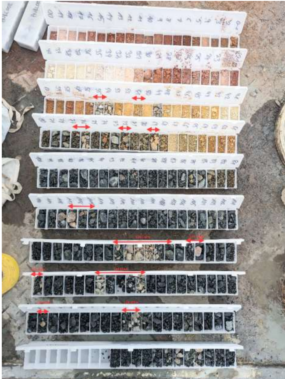
Figure 3: RC Drill Chips from TNRC001 0-192m showing Pegmatite Zones in red