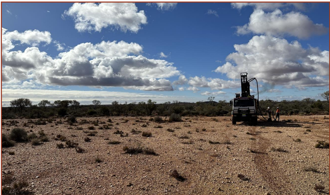
Figure 1 – Aircore Drilling at Edjudina Gold Project

M3 Mining Limited (ASX:M3M) (M3 Mining or the Company) is excited to announce the conclusion of its expedited drilling program at the Edjudina Gold Project ( Edjudina or the Project ).