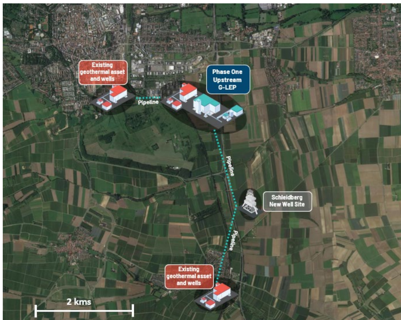
Figure 1. Landau G-LEP and well site location in relation to existing assets

We are looking forward to continuing our work with the City of Landau and local authorities in the short term to receive all our remaining permits in a timely manner and into the future as we deliver on the execution of our Phase One – Zero Carbon Lithium™ Project."