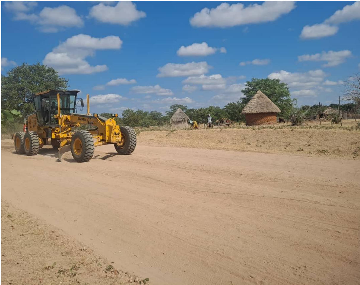
Figure 3 - Muzarabani to Hoya road rehabilitation and upgrade

The Company will also shortly commence the rehabilitation of the Muzarabani to Mahuwe road which is a vital access link between the districts.