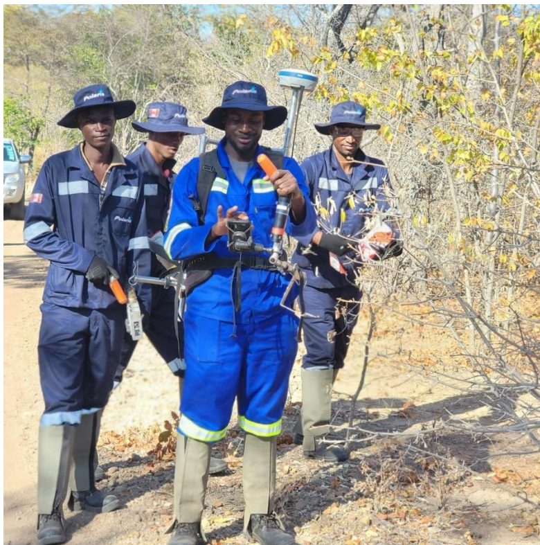
Figure 3 - STRYDE wireless node layout ahead of data acquisition

The CB23 Survey is utilising the latest generation STRYDE wireless nodes, which are less than 25% of the weight of comparable systems and makes the laying out and retrieving of the wireless nodes significantly easier, cheaper and substantially lowers the environmental footprint.