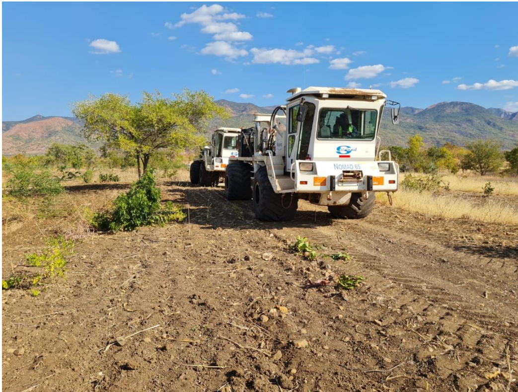
Figure 2 - Vibroseis units operating in the field

Earth Signal processed the CB21 survey for Invictus and this prior experience will enable an efficient processing workflow and provide a seamless, high-quality dataset across the basin.