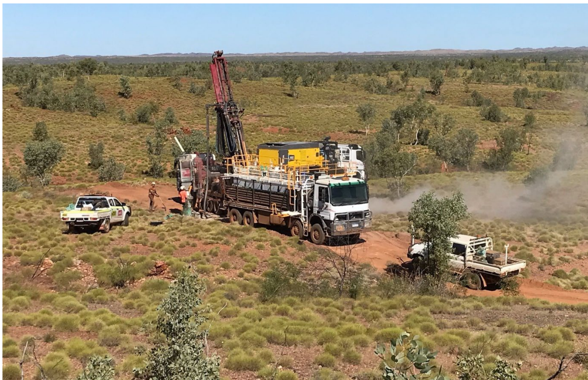
Figure 2: Red Rock Drilling at Woodward Range

The announcement is authorised by the Board of Olympio Metals.