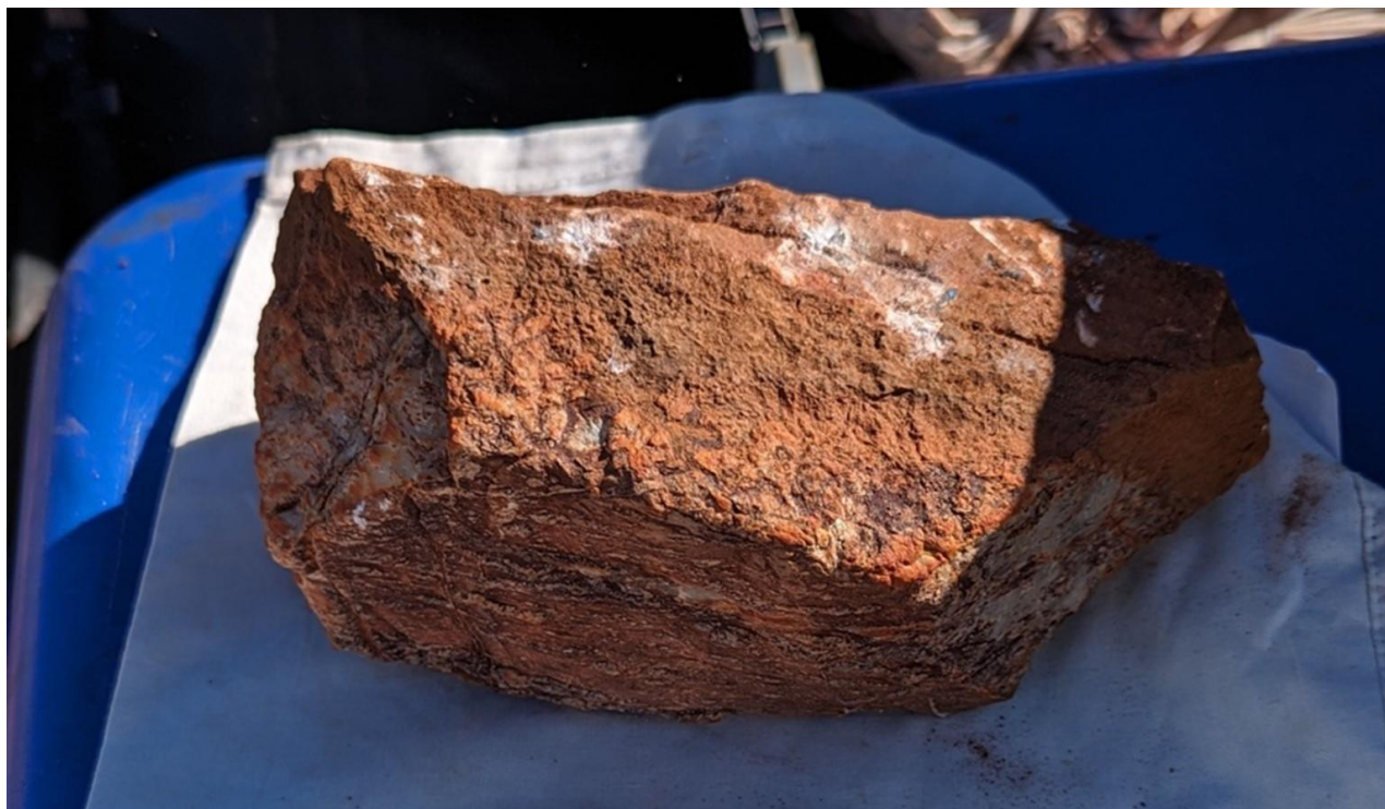
Figure 1. Rock Sample 23CR038 (Refer to Assay Table for Lithium Analysis)

Using the information gained from the discovery of the two lithium pegmatite trends, the Company is reviewing historic datasets with a view to potentially identifying new lithium pegmatite trends, and extensions to the known trends, within the broader Ruth Well and Osborne Project areas.