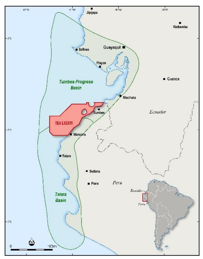
Fig 1. Tumbes-Progreso and Talara Basins

The Company and Jaguar have been considered as a "Qualified Subjects" by Perupetro (the Peruvian national oil regulator) and can now assume obligations for one hundred percent (100%) participation in a Technical Evaluation Agreement (CET) on area LXXXVI, subject to formal contracts being entered into between the parties and Perupetro which is expected to occur by the end of July 2023.