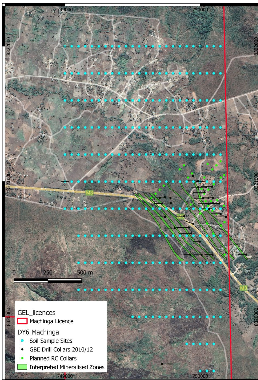
Image 3: Soil Sample locations and Planned Collars for RC Drill Program at Machinga North