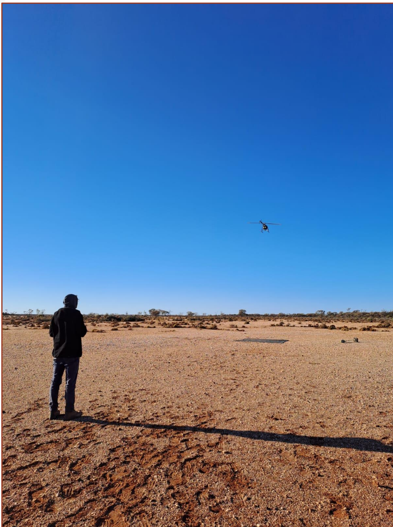
Figure 1 – DroneMag Survey at El-Capitan