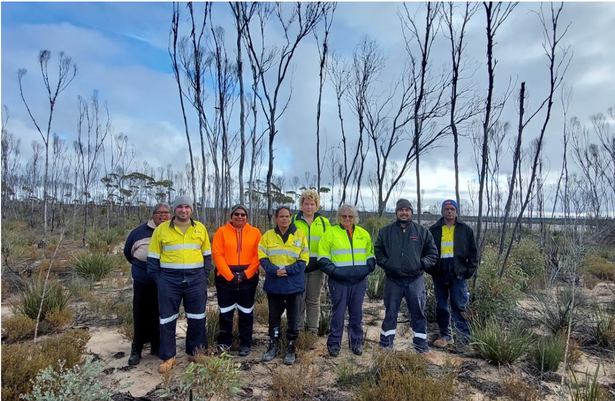
Figure 2. Survey participants, which include the Ngadju Native Title Holders and archaeologist and anthropologist consultants from JCHMC.