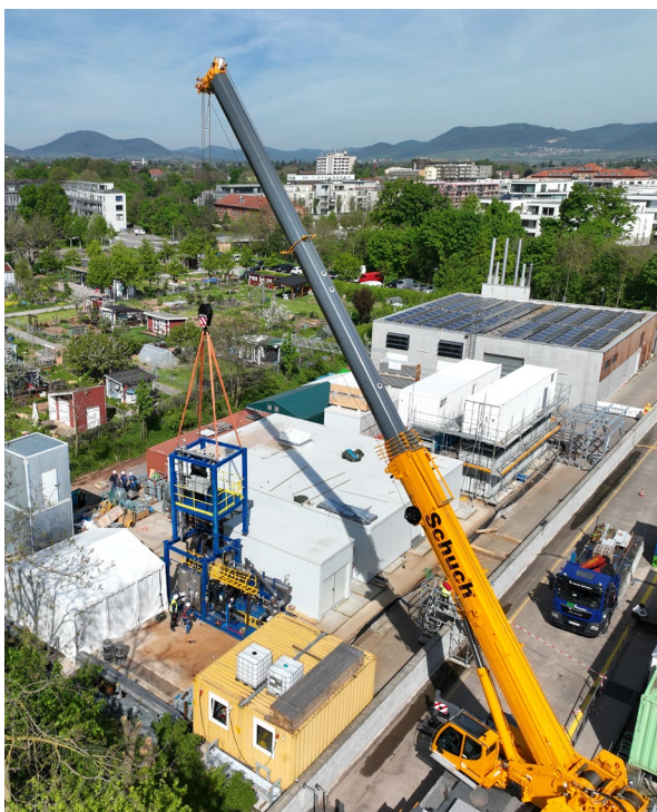
Figure 1 Installation of Crystallizer at LEOP, Landau

birth of the first domestically produced lithium chemicals industry in Europe, for the battery electric vehicle industry.