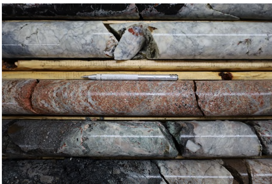
Figure 4: Diamond drill core (NQ, approximately 4.8 cm diameter) containing strong REE mineralisation (red coloured disseminations to semi-massive) within ferrocyanatite/calcioyanatite host rock. Hole POM-23-03, 173 metres downhole depth.