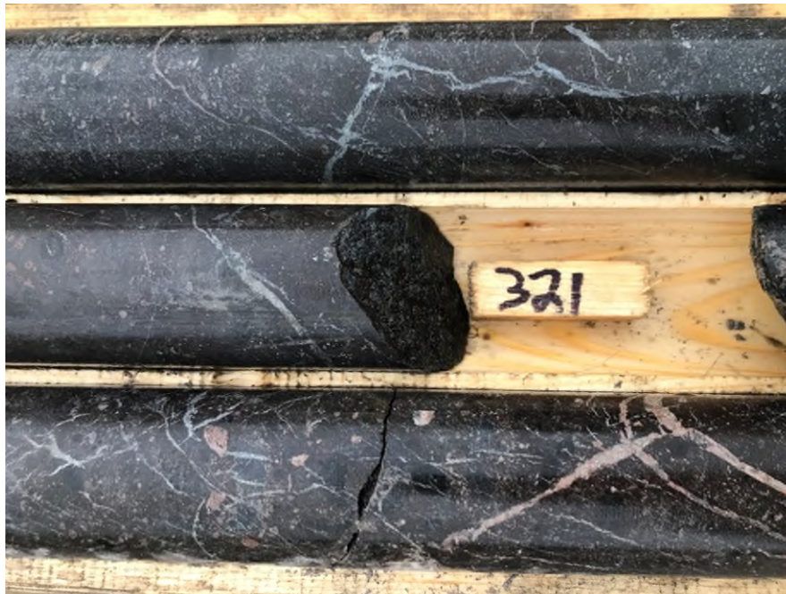
Figure 3: Diamond drill core (NQ, approximately 4.8 cm diameter) containing REE mineralisation (reddish-brown coloured blebs and within veins) within magnetic silicocarbonatite host rock. Hole POM-23-02, 321 metres downhole depth.

Hole POM-23-02 (Figure 2) was completed at a depth of 330 metres downhole (Appendix I). This hole was collared approximately 500 metres to the north of POM-23-01, which intersected in excess of 500 metres of visible REE mineralisation (assay results still pending). The hole principally intersected silicocarbonatite rocks containing low grade to trace mineralisation, mainly in veins and fractures (Appendix II, see Figure 3 below of core section). The silicocarbonatite was quite magnetic, corresponding to the observed anomaly on airborne magnetic images.