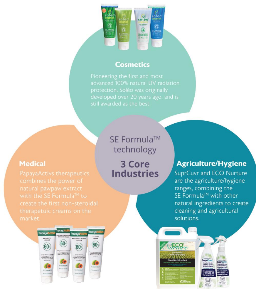
Figure 1: Skin Elements three core programmes – all underpinned by the SE Formula biotechnology.

Skin Elements uses a three phase process in the development of our brands. Utilising the SE Formula, the Company starts by developing an all-natural formula for the desired field and purpose. This is the first phase of our development process.