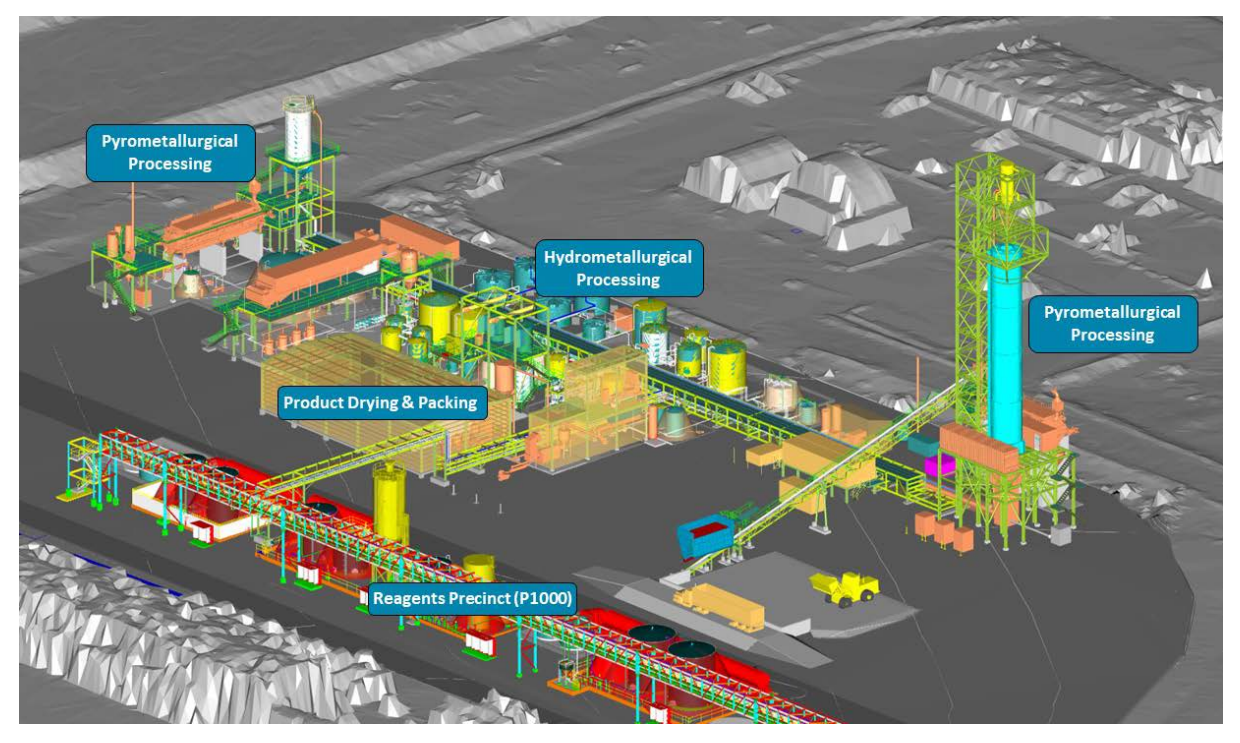
Figure 2 – Mid-Stream Demonstration Plant location and layout

A schematic of the Project is detailed below (refer Figure 2).