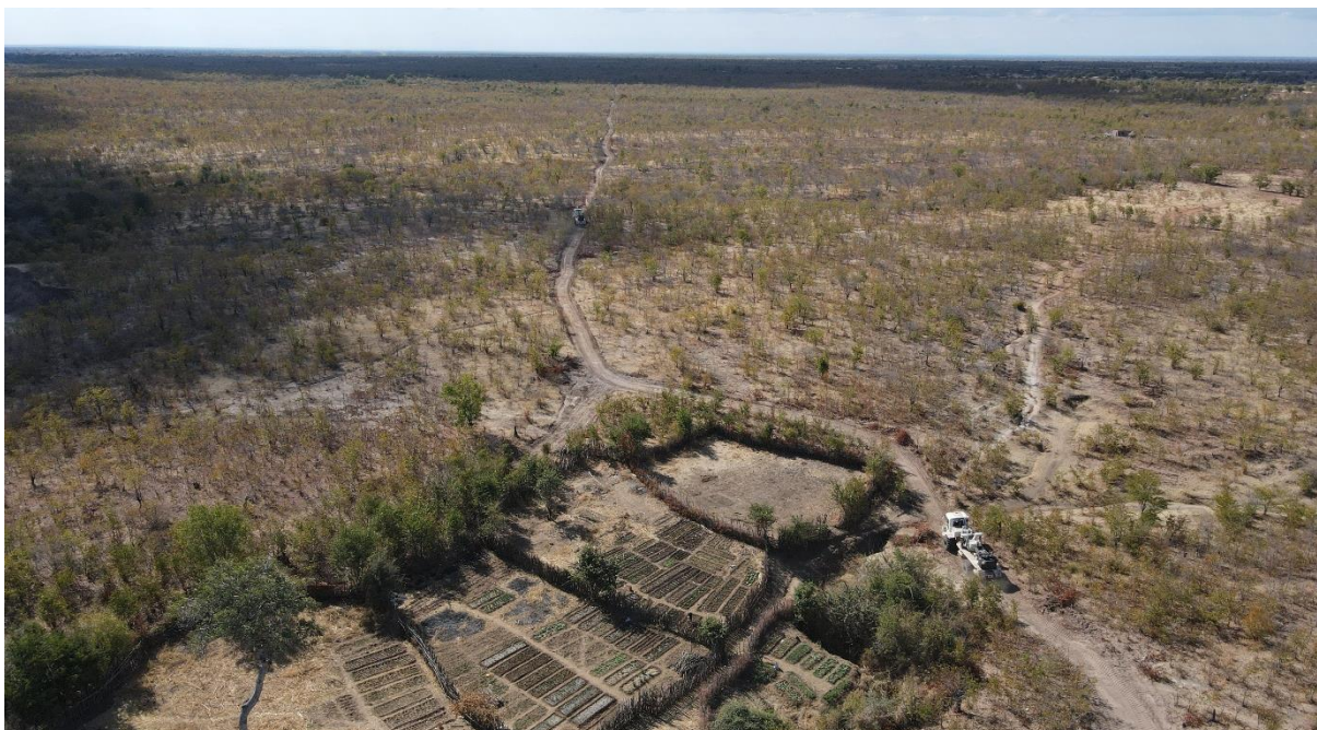
Figure 3 - Polaris vibroseis trucks acquiring along the cleared lines, here bypassing local agriculture