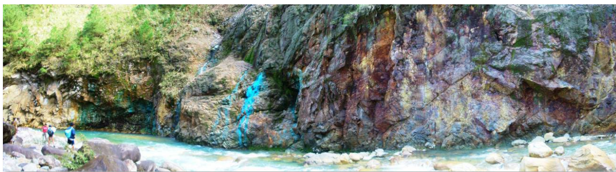
Figure 3. Blue and green copper minerals observed along the walls of the Botilao outcrop.