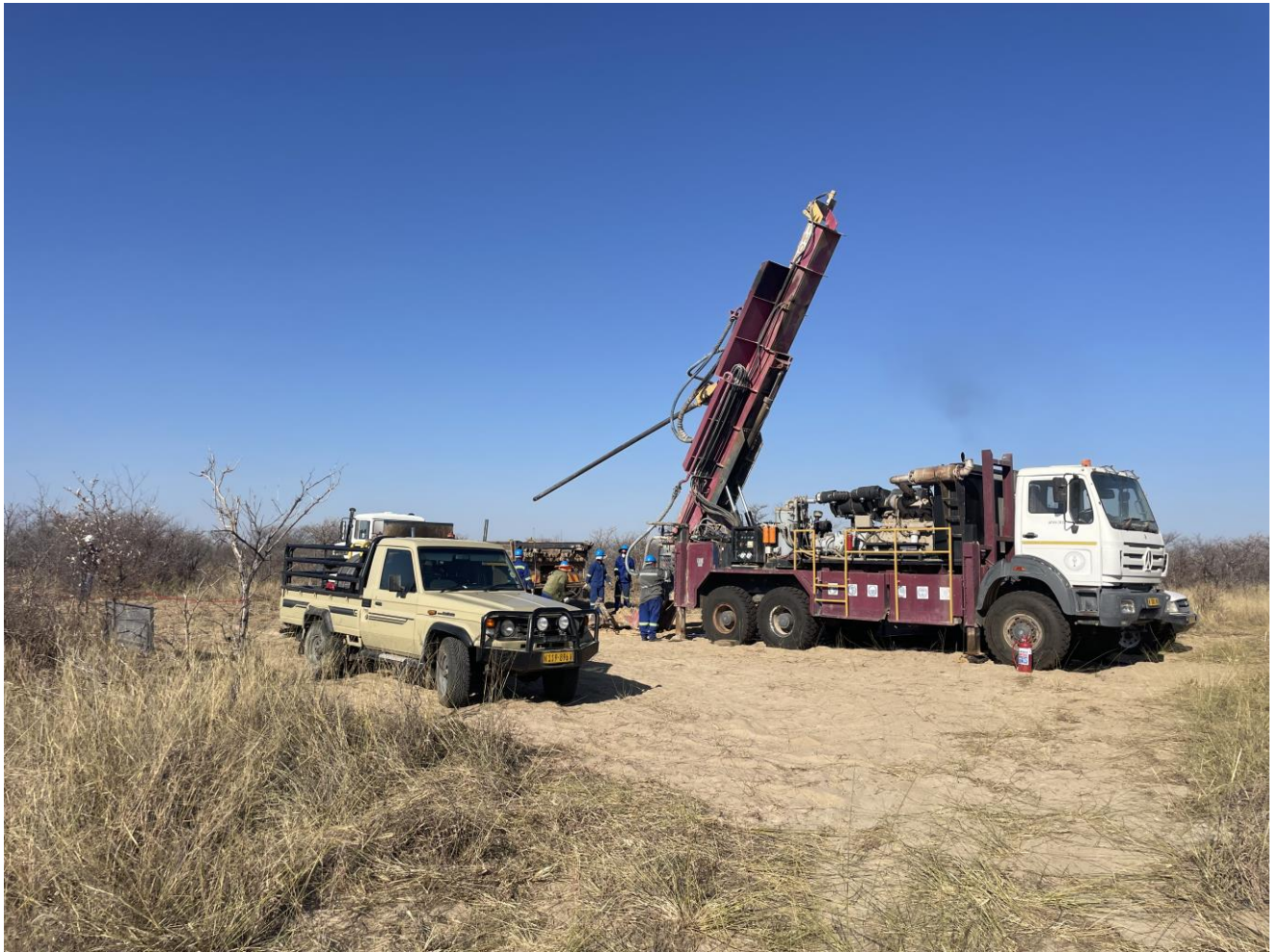
Figure 1: Drill rig in operation at Fiesta

A number of key targets have been defined both within and along strike of the known mineralisation which is consistently developed over 3.5 kilometres.