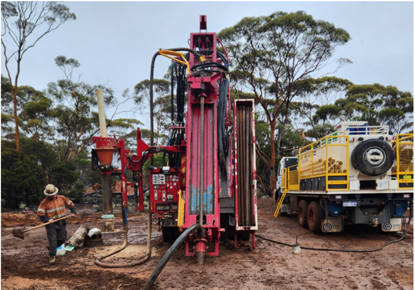
Figure 1: Follow up RC drilling begins on tenement E63/2001 targeting previously intersected pegmatites under alluvial cover

As reported in ASX announcement 13 July 2023 it is yet to be determined if the pegmatites intersected in holes DSAC0031 to DSAC0034 coalesce as part of a larger swarm or form a single pegmatite unit. The completion of up to two RC holes under this zone will help appraise the thickness of the pegmatites at this location.