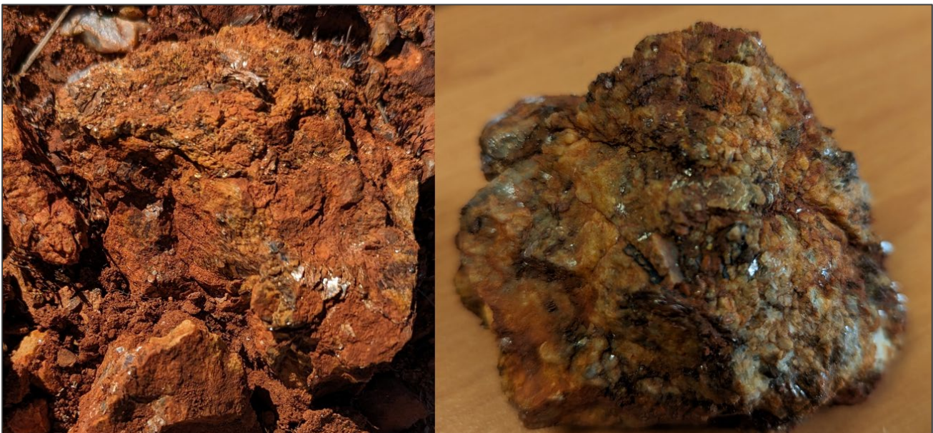
Figure 2: Photographs of rock sample RX023 which returned 0.66% Nb 2 O 5 and 0.27% Ta 2 O 5 .

Float samples taken from the ground between the Loader prospect and an outcropping quartz core showed high grade Tantalum (Ta) Niobium (Nb) and Gallium (Ga) (Figure 2). It is interpreted to be associated with a sodic alteration zone.