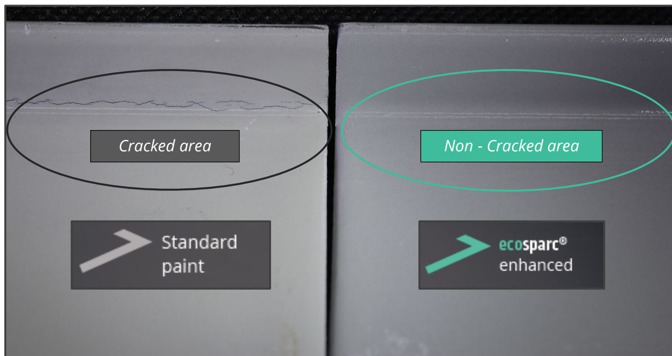
Figure 1: Significant improvement in crack resistance after 252 cycles of thermal testing

These results further reinforce the value proposition of ecosparc ® in increasing time to first maintenance and then extending subsequent maintenance cycles providing both cost and sustainability benefits to the asset owner through reduced paint use and maintenance (re-coating) costs. Sparc is currently conducting life-cycle analysis to quantify these benefits to assets owners.