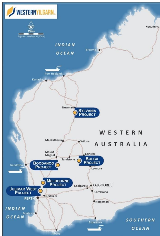
Location of Western Yilgarn portfolio