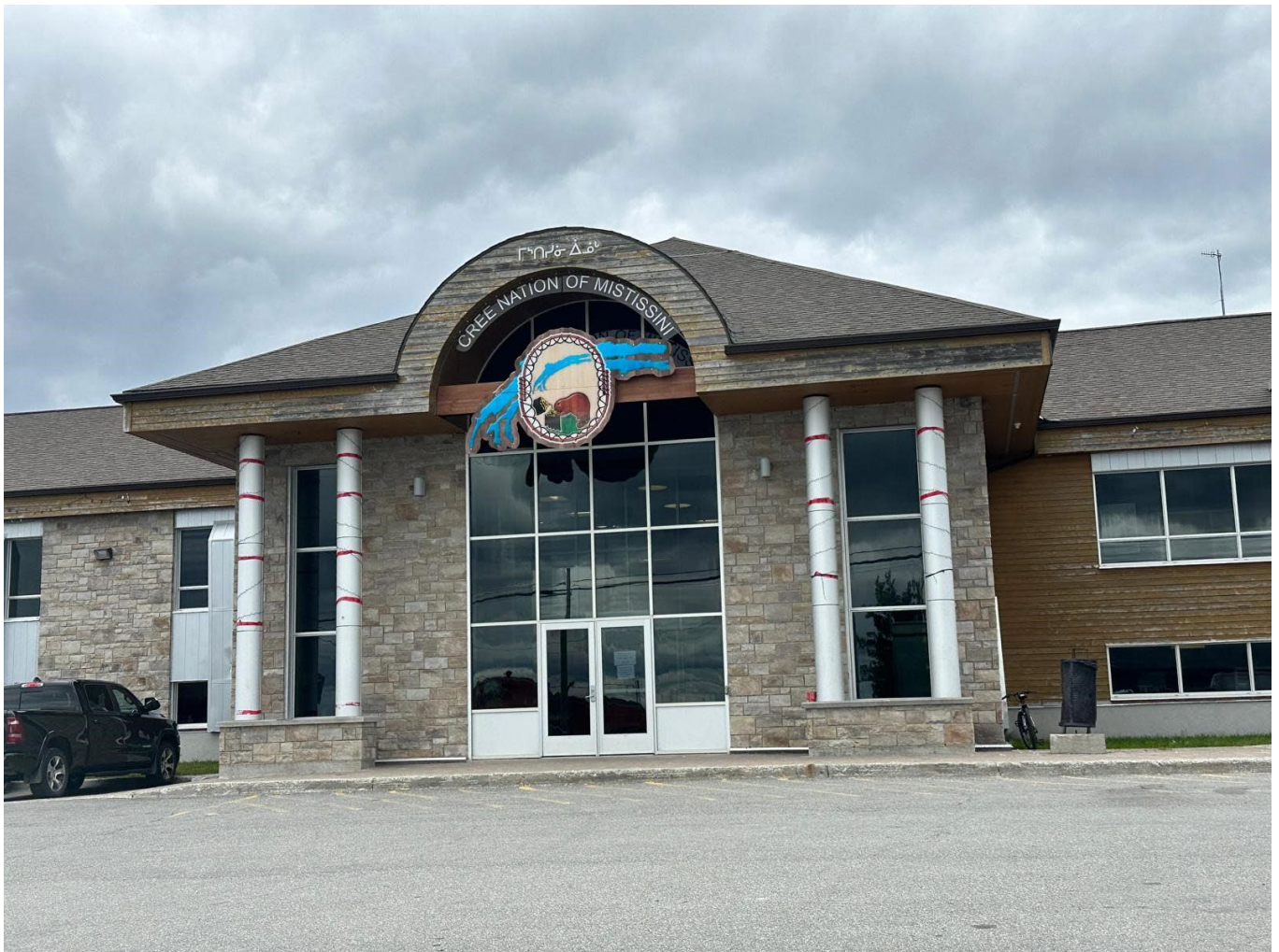
Figure 5 – Cree Nations office – Mistissini, Quebec