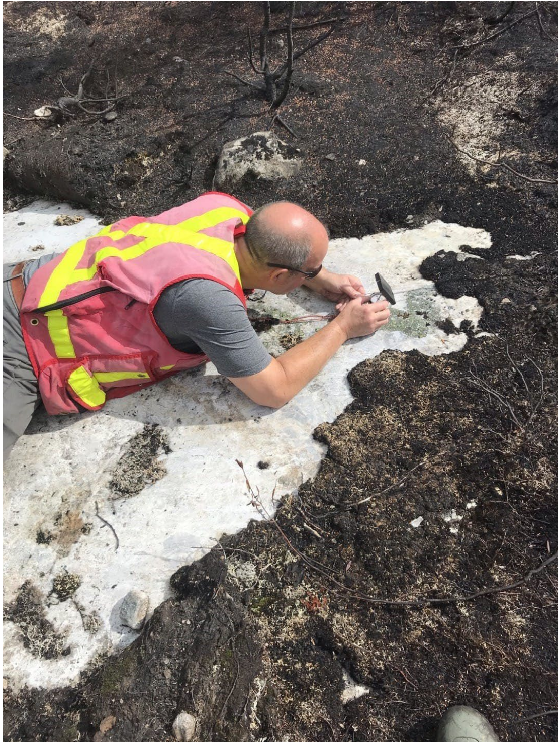
Figure 3 – Winsome Resources’ VP of Exploration, taking measurements on a pegmatite outcrop at our flagship project, Adina, in Quebec, Canada