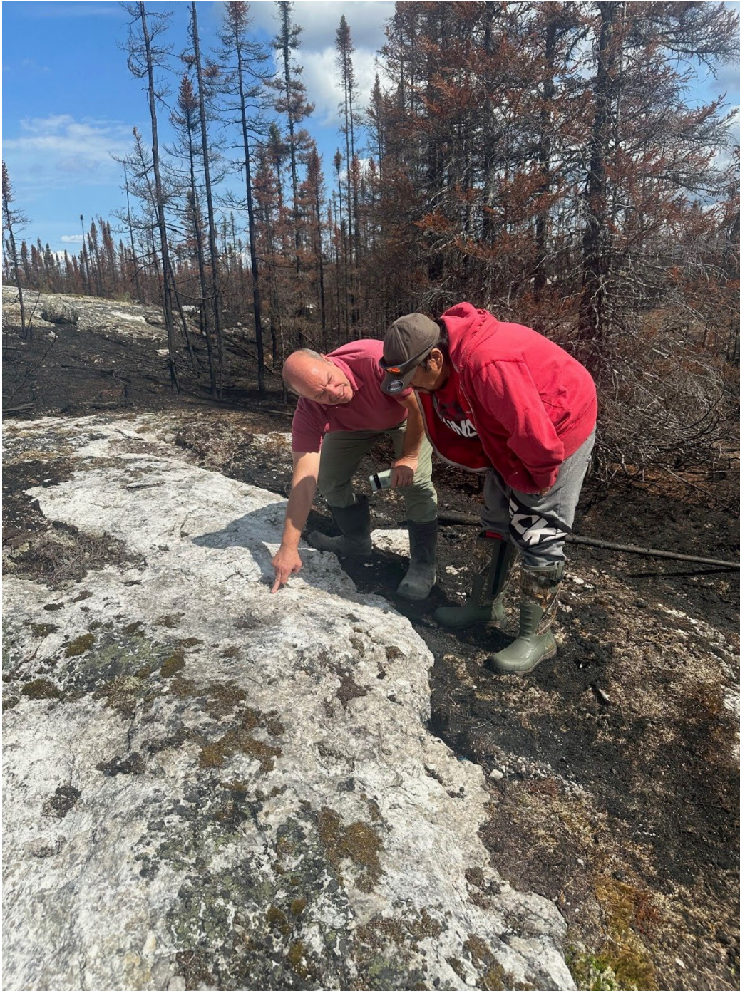
Figure 2 – Winsome Resources’ VP of Exploration, along with tallyman from Cree community Mistissini, closely examining an exposed pegmatite dyke at our flagship project, Adina, in Quebec, Canada