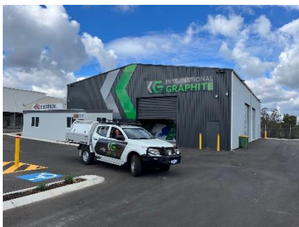
Fig 1 Collie R&D facility

International Graphite Limited (ASX: IG6) has received works approval from the Western Australian Government to install new graphite micronising equipment at the Company's downstream research and development facility in Collie, Western Australia.