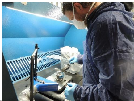
Fig 2 Micronising pilot samples