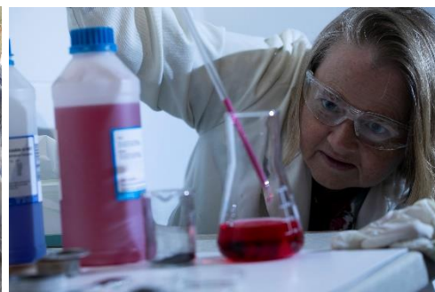
Fig 3 Testwork at Collie

The equipment is currently in transit from North America and is expected to arrive at Fremantle Port next month (September 2023).