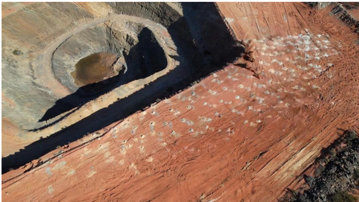
Figure 1 - First Blast (drone imagery) at Selkirk's North wall

Mining at Selkirk will proceed for approximately six months, with ore being stockpiled in Menzies and subsequently hauled to Genesis Minerals Limited's (ASX:GMD) Gwalia Processing facility in February 2024 for processing in a single parcel. The JV parties have budgeted for a conservative gold price of $2,850 per ounce which is intended to provide sufficient risk protection in the event of gold price fluctuations and upside to the current spot price of ~$2,950 per ounce.