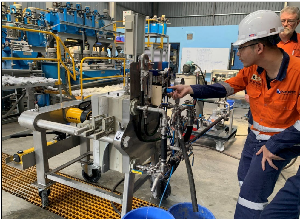
Figure 3 - Vendor piloting - Pressure filtration testwork trials