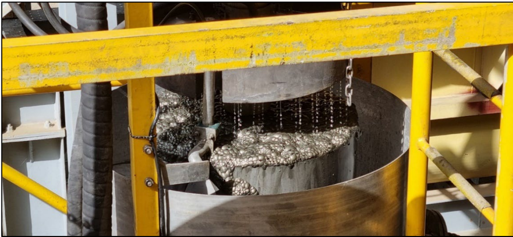
Figure 2: Vendor piloting - Jameson Cell trials producing improvements in Nickel and MgO concentrate grades