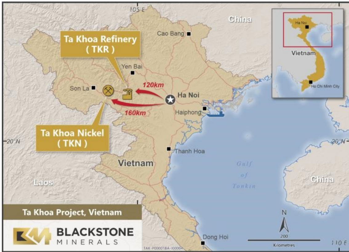
Figure 1. Ta Khoa Project Location