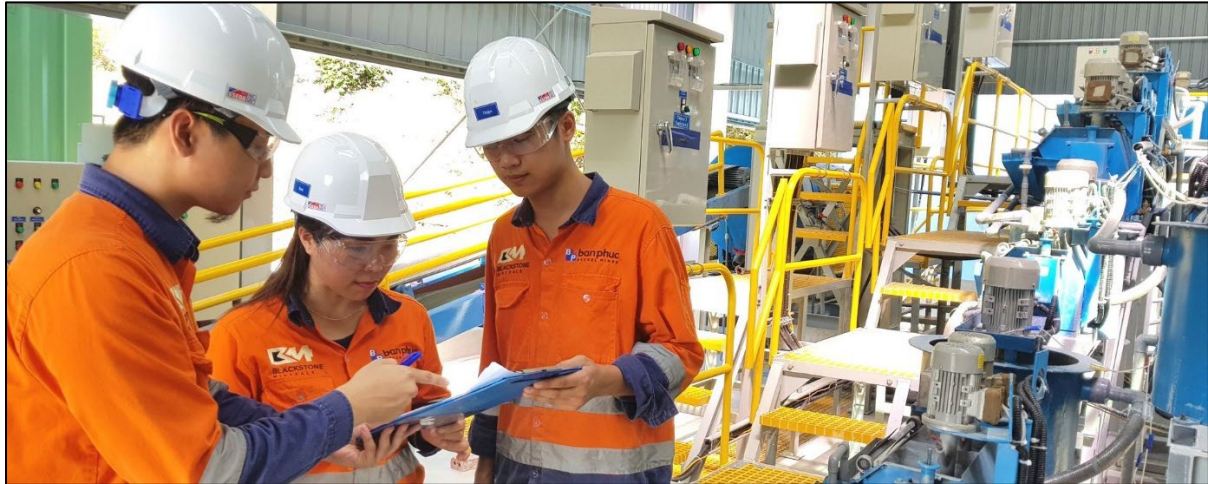
Figure 1: TKN Pilot Plant, Ban Phuc, Vietnam

Blackstone Minerals Limited (“Blackstone” or the “Company”) is pleased to announce the completion of the Ta Khoa Nickel (“TKN”) plant pilot programme and significant progress toward completion of the variability testwork programme at the existing mine site in Vietnam. The completion of the TKN pilot programme is in addition to completing the Ta Khoa Refinery (“TKR”) pilot programme (Refer to ASX announcement 15 November 2022). This demonstrates completion of all scheduled piloting activities for the Ta Khoa Project.