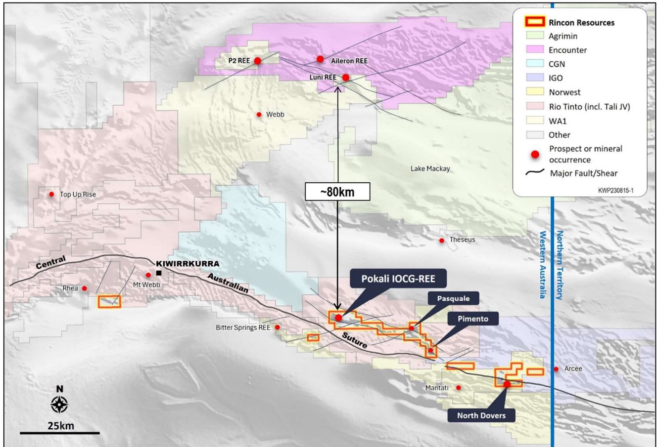
Figure 2: Kiwirrkurra Project, West Aruntashowing location of Pokali IOCG/REE Prospect.