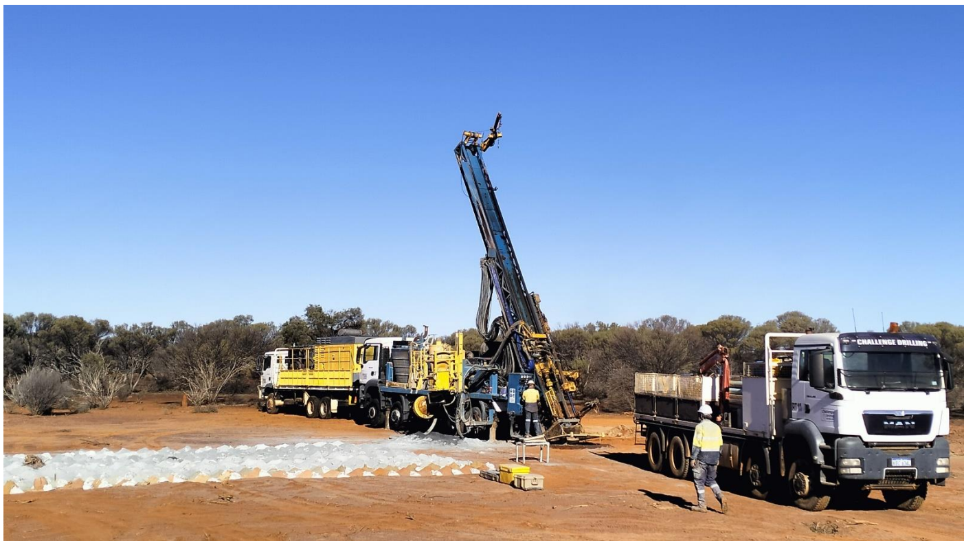
Figure 1, Challenge Drilling onsite at McTavish East.

Ref. 1 The Mining Handbook Geol. Surv. Memoir No 1. Chapter2, Economic Geology, Part3, Section1, 1919, Englishman/Cosmopolitan Mine production records listed on Minedex ( https://minedex.dmirs.wa.gov.au/ ).