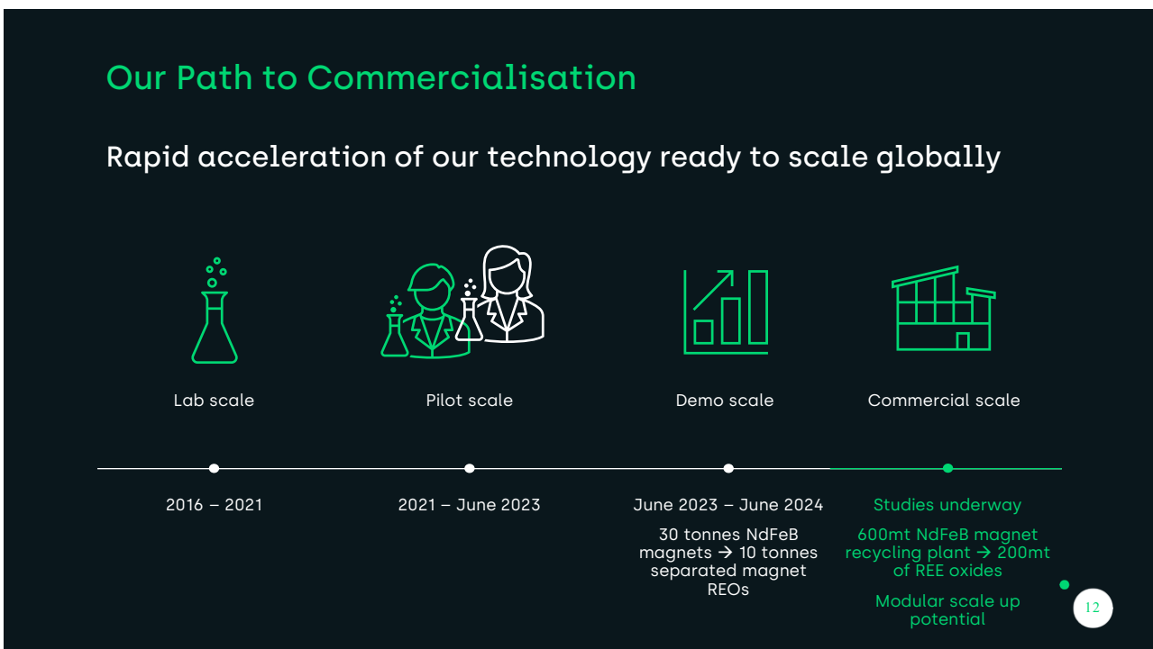
Figure 6: Ionic Technologies path to production.

Ionic Technologies proprietary technology provides a universal method for the recovery of high purity REOs from lower quality and variable grade magnets, to be used in the manufacture of modern high-performance and high specification permanent magnets required to support substantial growth in both EV and wind turbine deployment.