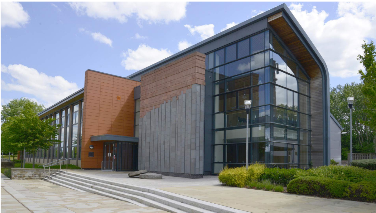
Figure 5: BGS's Nottingham facility in the UK.