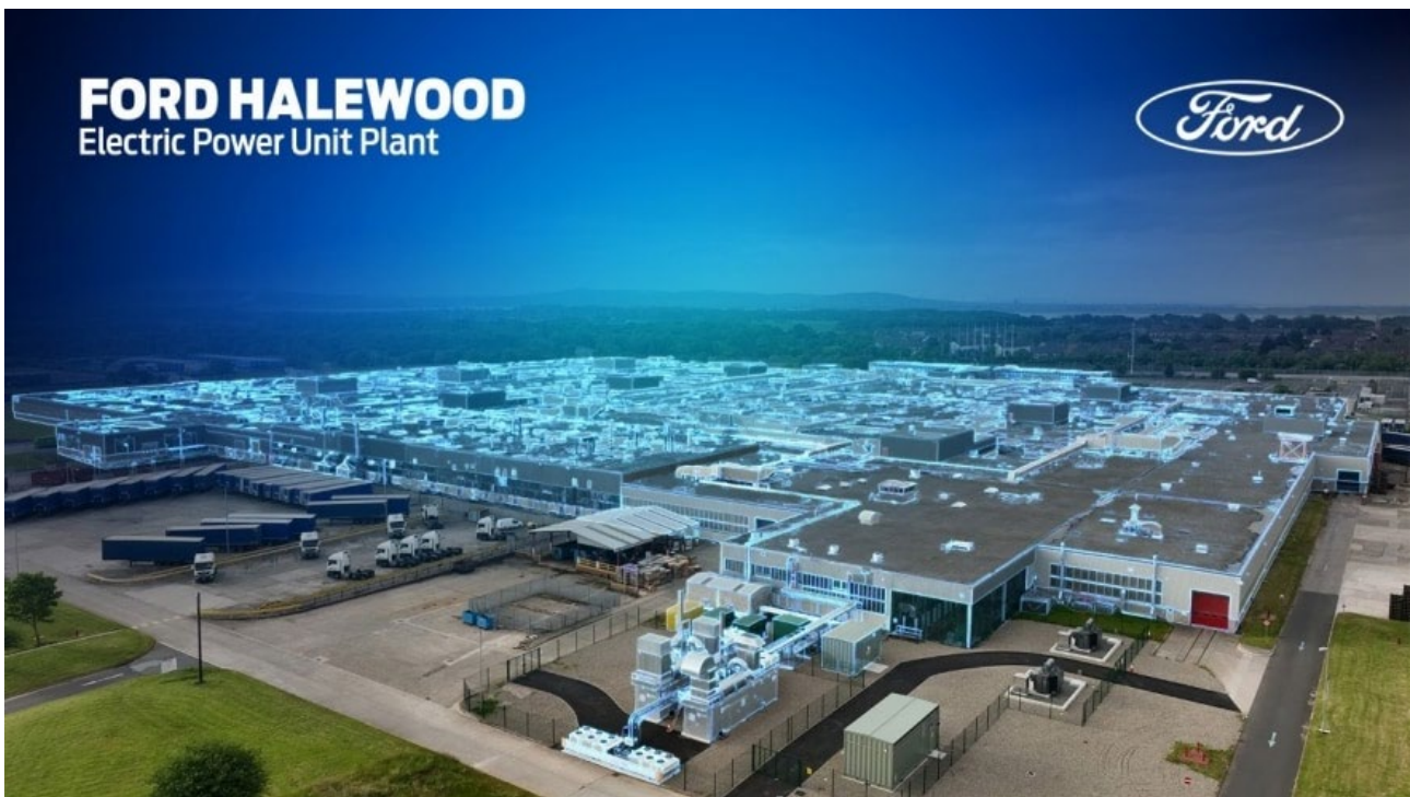
Figure 2: Ford's Halewood facility in the UK.

"As a world leader with over 30 years of experience, this project aligns with LCM's values and we look forward to contributing to the UK Green Targets for EVs, which will create an attractive alternative circular supply chain."