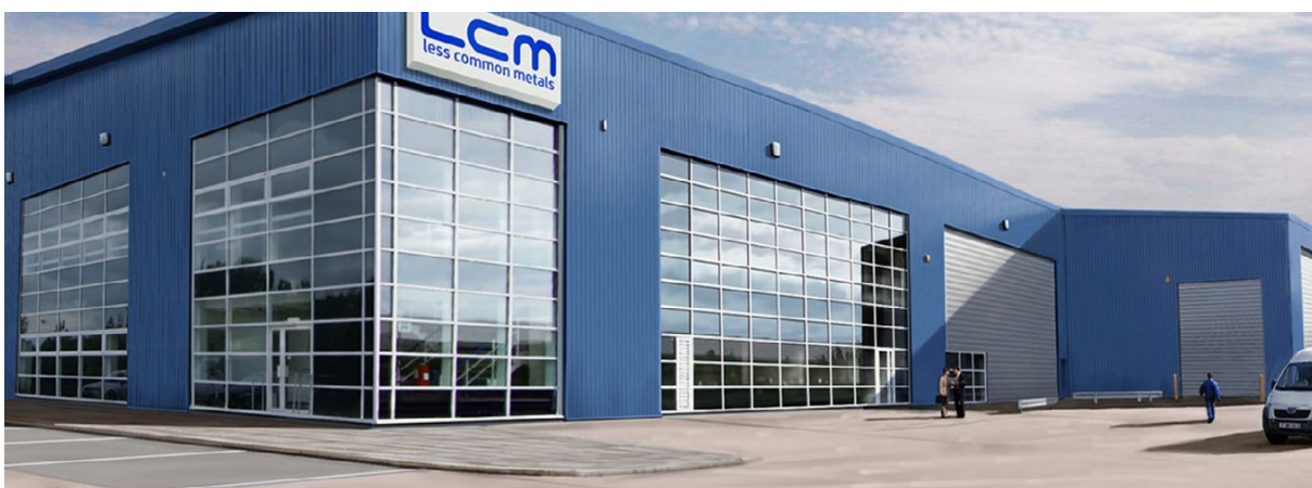
Figure 3: LCM's facility at Ellesmere Port in the UK.