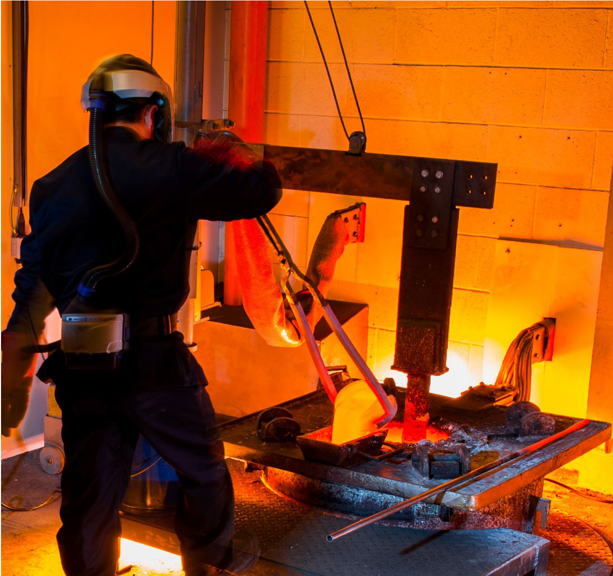
Figure 4: Rare earth metal alloy production via electrolysis at LCM.