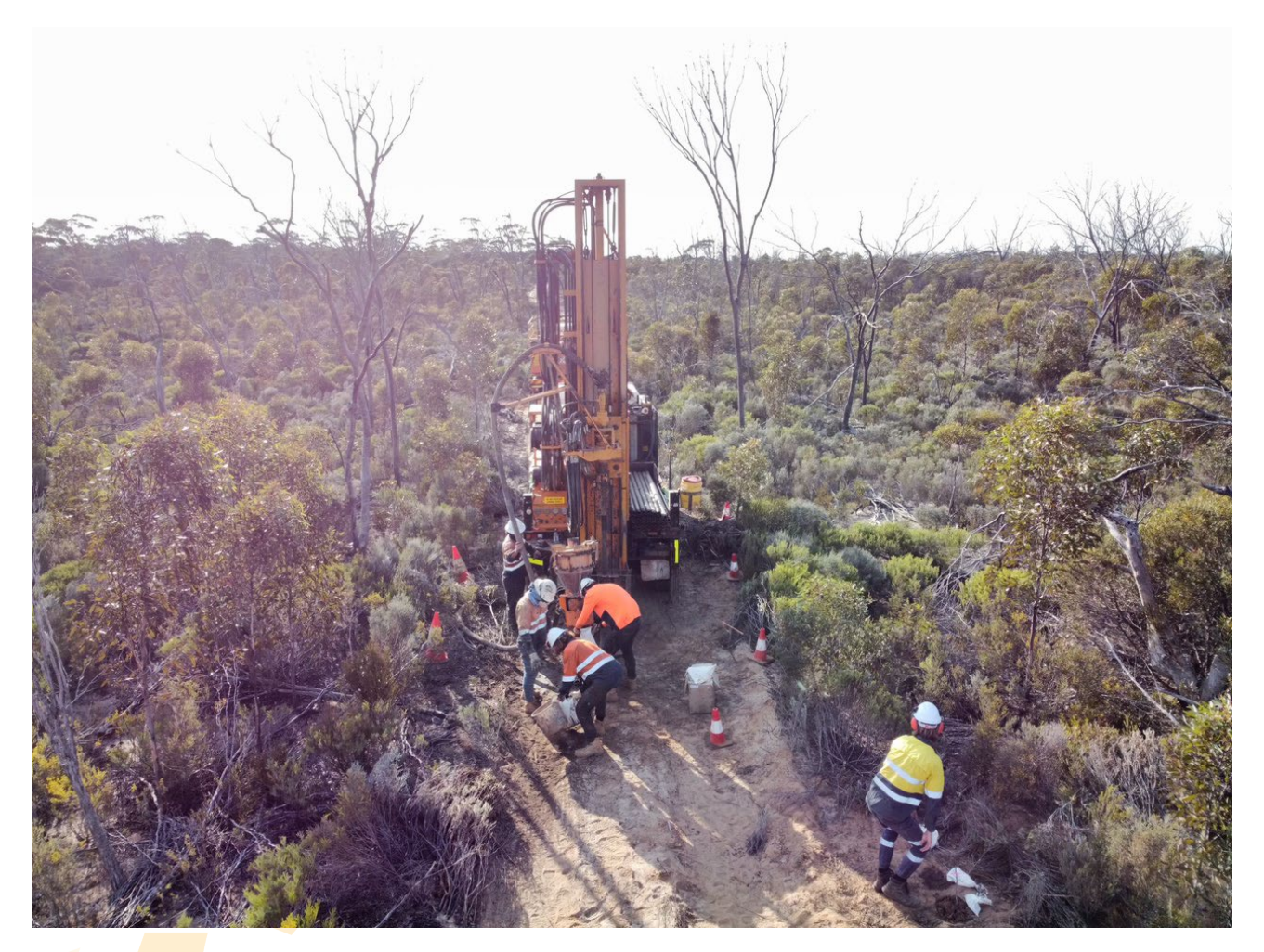
Figure 1 – Air Core drilling rig in operation at Dingo Rocks.

Assay results from the program are expected in November.