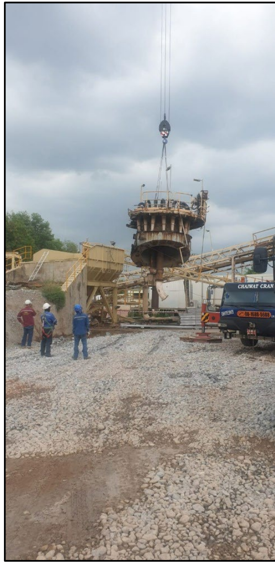
Removal of the Cyclone separator for replacement from Plant #1.

Key areas of work in the CIL/Elution Circuits in August and September included: