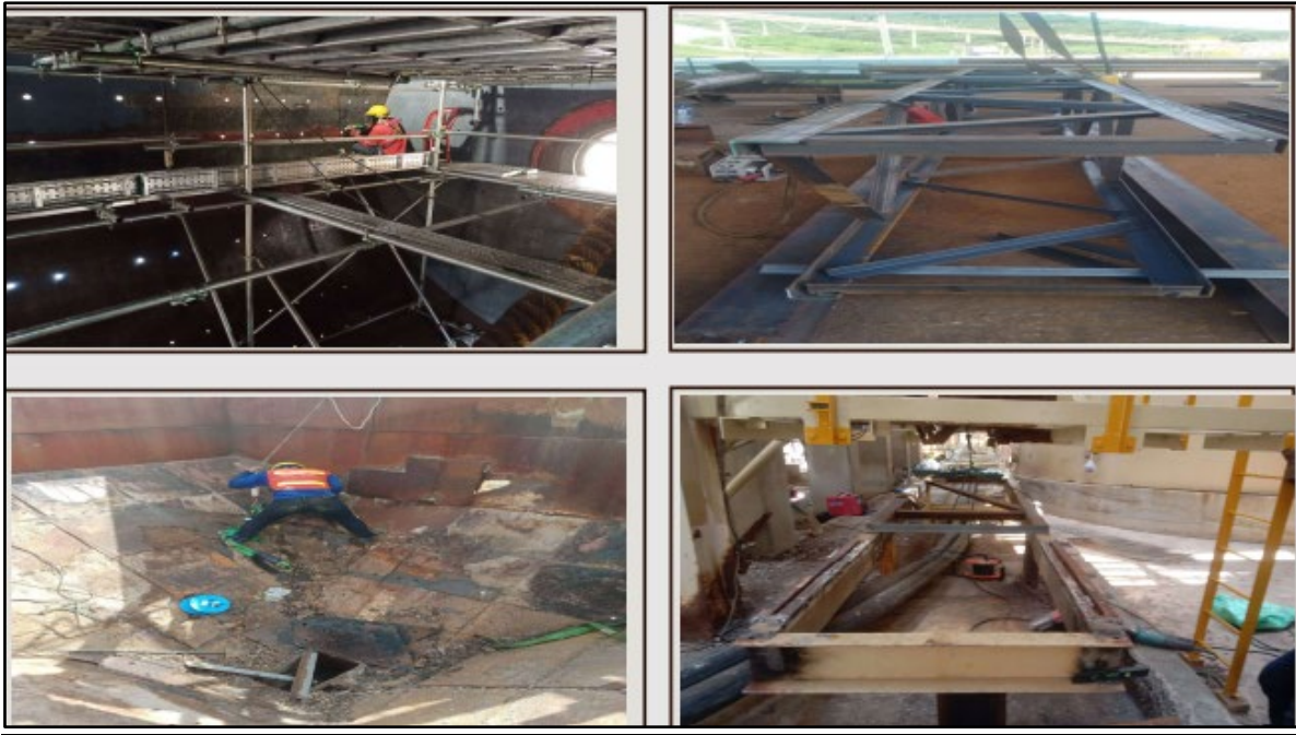
Grinding Circuit repairs above (left to right): SAG mill rubber lining removal, structure frame for conveyor CV09, repairs to conveyor hopper and conveyor frame repairs CV04.