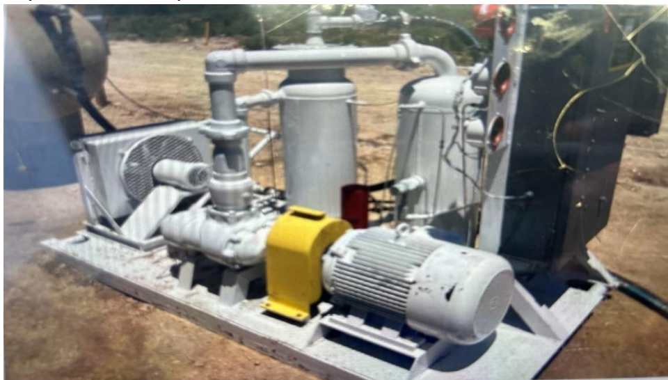
Figure 2: Electrically Driven “Smart Compressor” Installed at White Hat Ranch

The Winchester team recently completed the first phase of a compression optimization project for its White Hat Ranch field, with the second phase underway. When completed, the compression project hopes to increase production in White Hat Ranch by reducing overall field pressure and eliminating fuel gas requirements, while reducing compression costs and increasing compressor runtime and reliability.