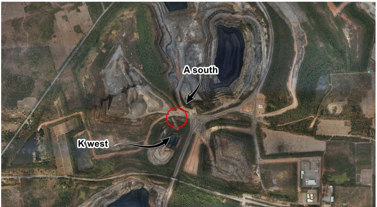
Location of the grade control drilling