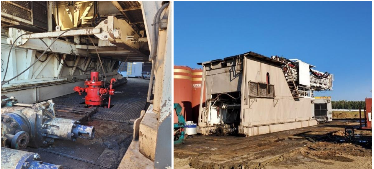
Figure 4. Ensign Rig 438 Rig Demob post successful drilling operations.