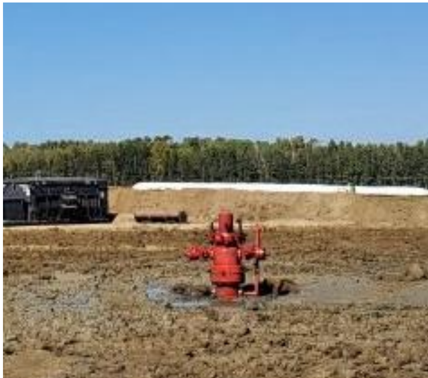
Figure 5. Wellhead post successful drilling – awaiting frack stimulation completion