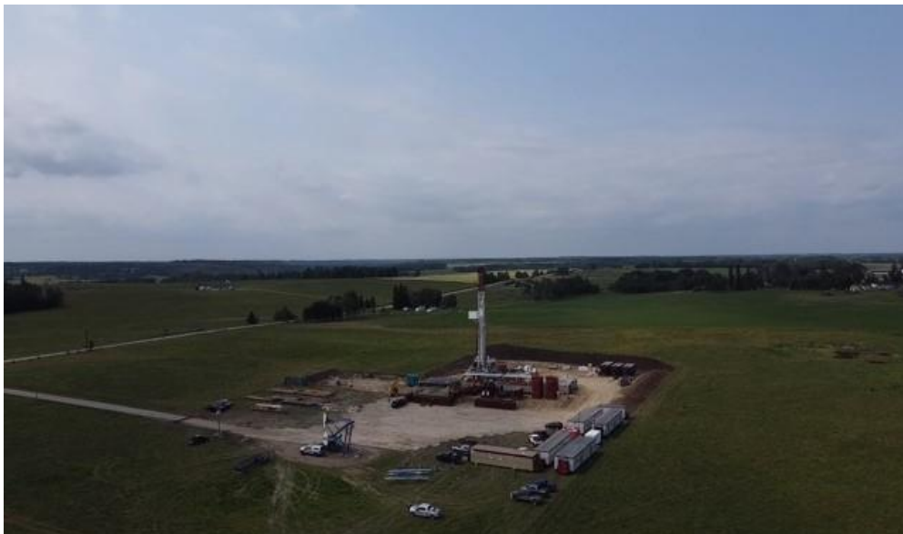
Figure 1: Ensign 438 Drill Rig on location at Certus Caroline 01-27-33-05W5 well in Central Alberta.