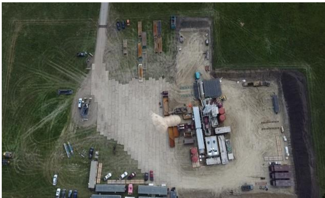
Figure 2. Overhead shot of the Certus Caroline well pad and Ensign 438 drill rig on location.