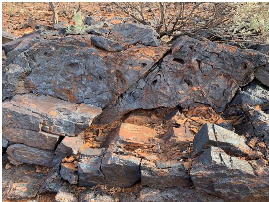
Figure 2: Manganese outcropping 2 – Tenement E09/2543

Manganese is recognised as a critical mineral by the Office of the Chief Economist (Australian Government Department of Industry, Innovation and Science). Further, a White House document (June 2021) states that manganese use in battery cathodes may result in the metals preferred element emergence in next generation battery cells, due to its ‘relative safety’ and ‘having by far the most stability’.