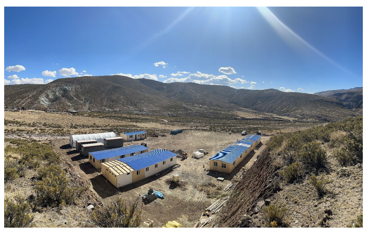
Figure 3: Exploration camp under construction at Picha

Camp installation has progressed according to plan and completion works are now underway on the final fittings.