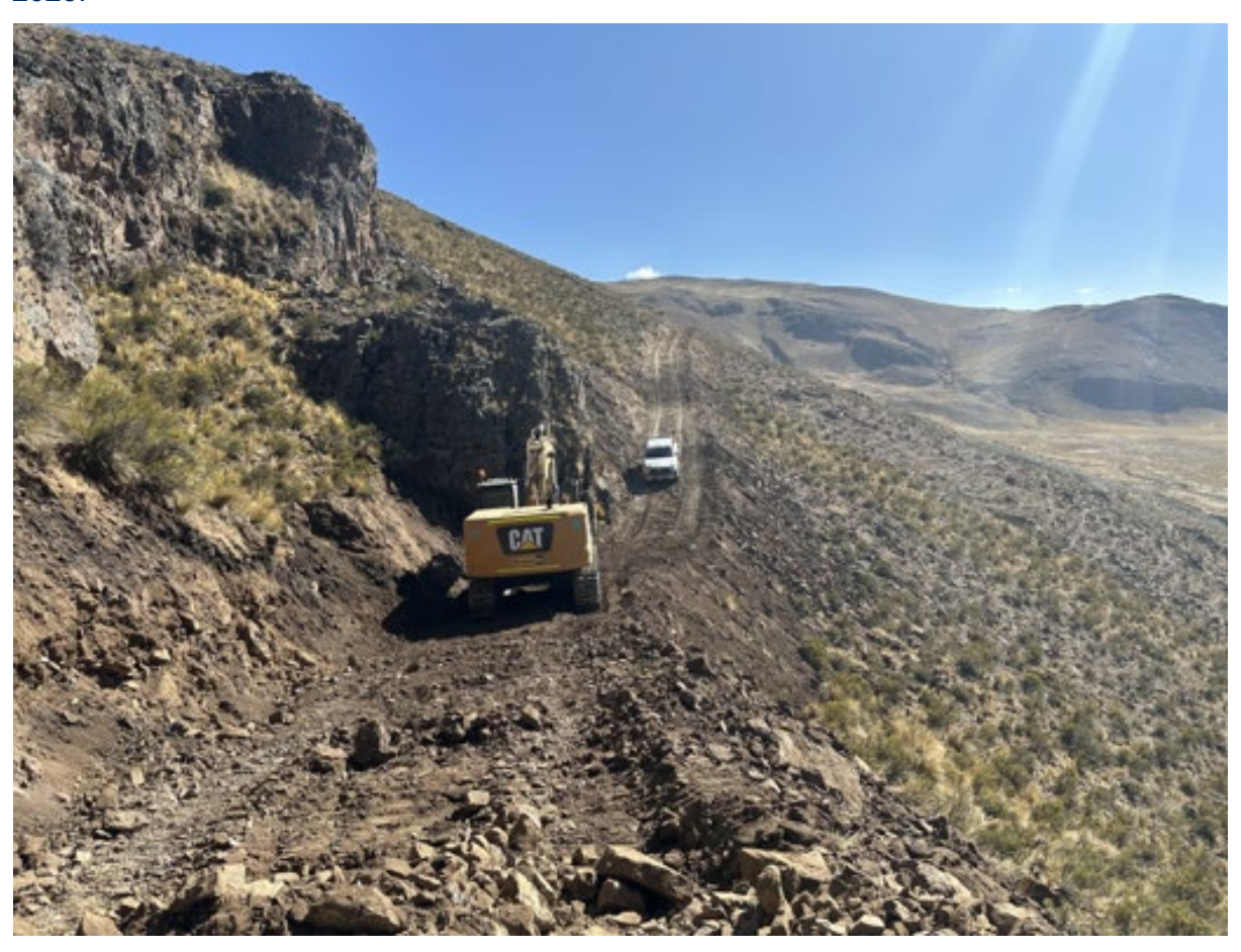
Figure 4: Access road construction underway at Picha Project in Peru

Access roads and drilling pads for the first 9 holes are well progressed and due for completion by the end of September to facilite the commencement of drilling in the first week of October 2023.