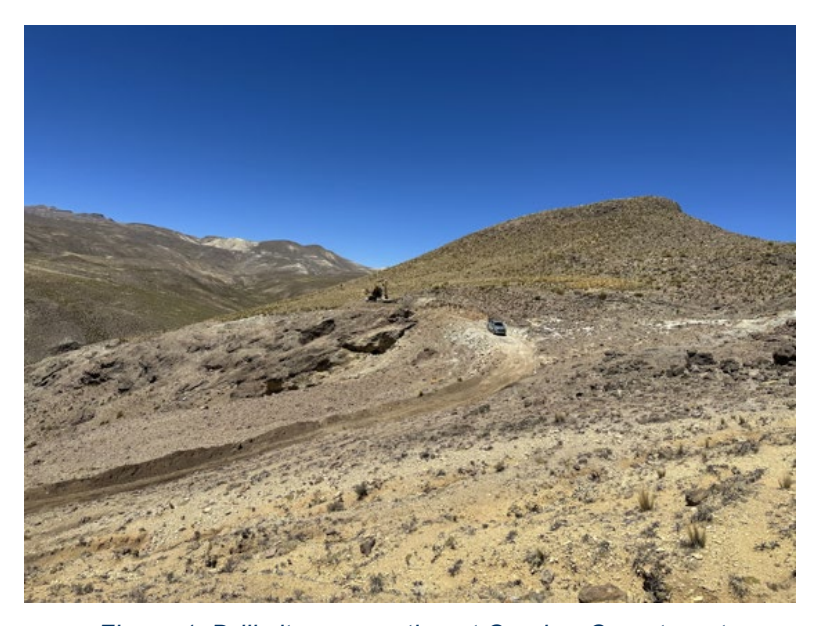
Figure 1: Drill site preparation at Cumbre Coya target

"We look forward to the commencement of drilling in the next two weeks."