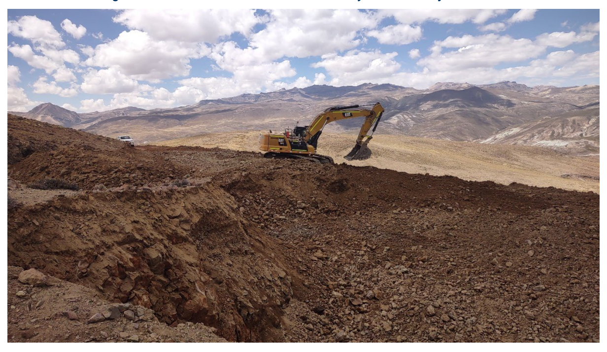
Figure 5: Drill pad construction underway at Picha Project in Peru