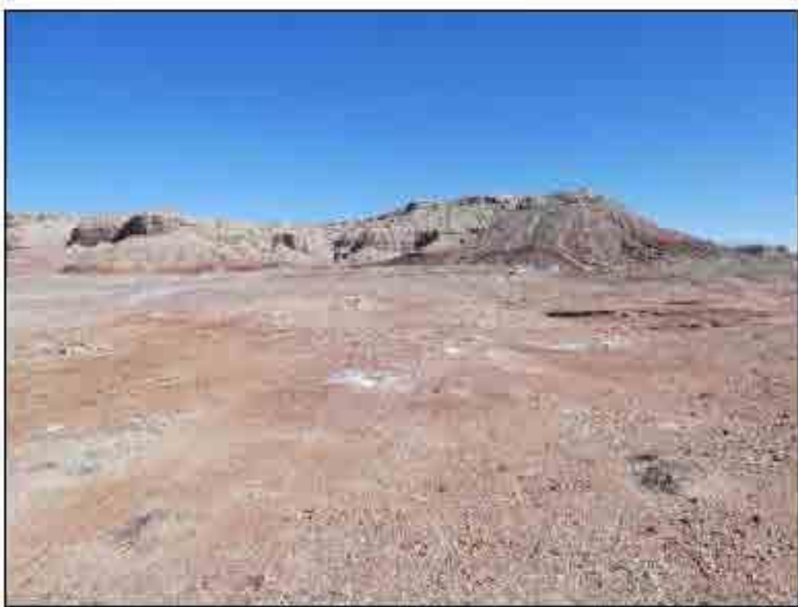
Figure 2: The existing Mt Fuel-Skyline Geyser pad only needs to be re-instated for drilling to begin.

This announcement has been authorised for release by the Executive Chairman and CEO.