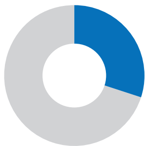
30% female representation on the Board

In June 2022, the Board approved measurable objectives for achievement by 31 December 2026 as outlined below: